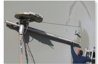
Versatile track system